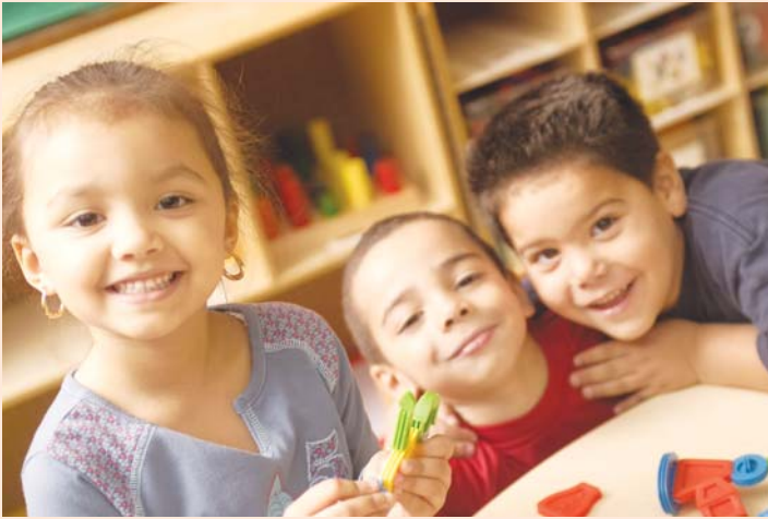
Together, we can inspire young children to succeed in school.

The Board of Directors of the United Way of the Greater Lehigh Valley has recognized the Volunteers of America Children's Center in Allentown among its top supported agencies. The Children's Center received the "High Green" designation for "excellent program performance."